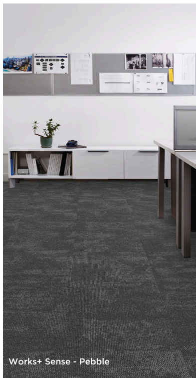
Works+ Sense - Pebble