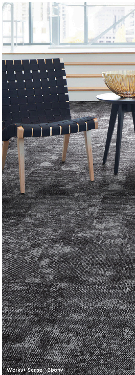
Works+ Sense - Ebony