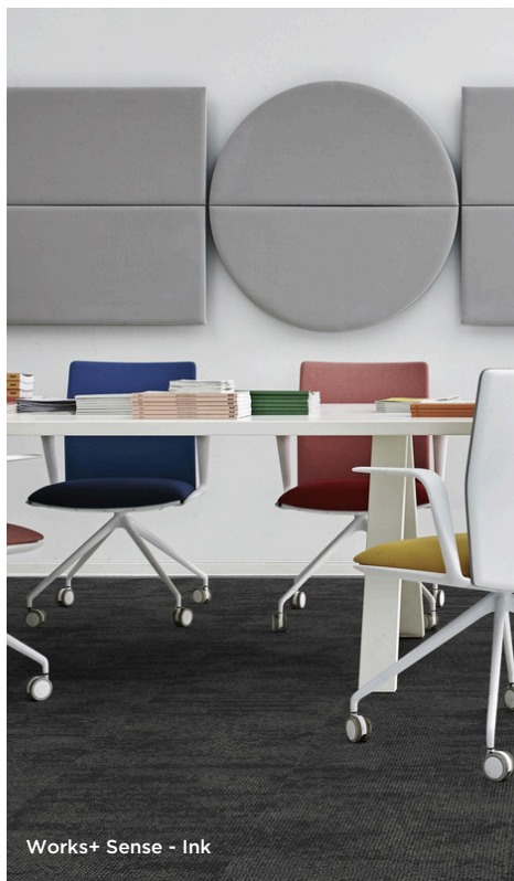
Works+ Sense - Ink