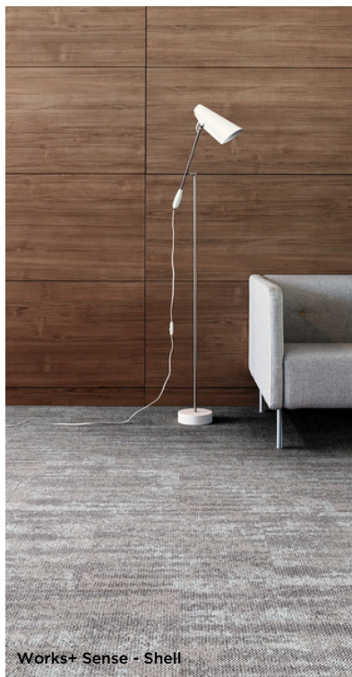
Works+ Sense - Shell