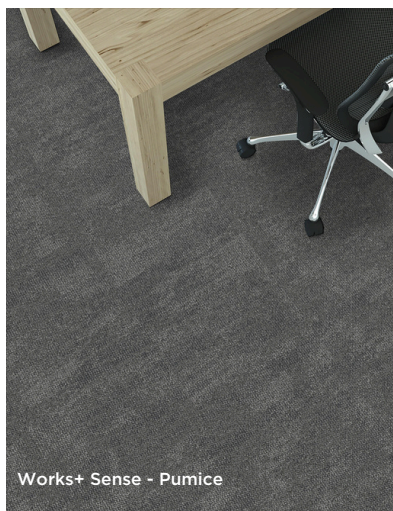
Works+ Sense - Pumice