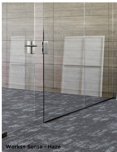
Works+ Sense - Haze