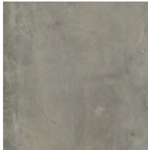
A003-02 Textured Stones - Cool Polished Cement