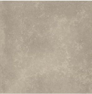
A003-01 Textured Stones - Polished Cement