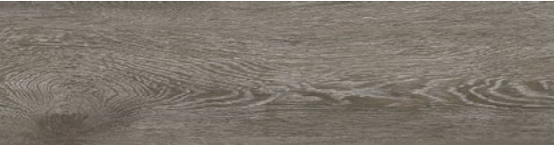
A004-05 Textured Woodgrains - Grey Dune