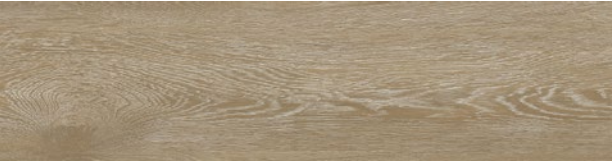
A004-06 Textured Woodgrains - Antique Light Oak