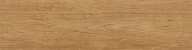
A002-12 NEW Natural Woodgrains - Cedar