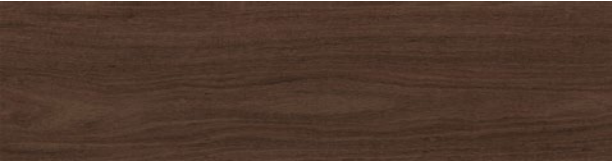
A002-02 Natural Woodgrains - Madagascar