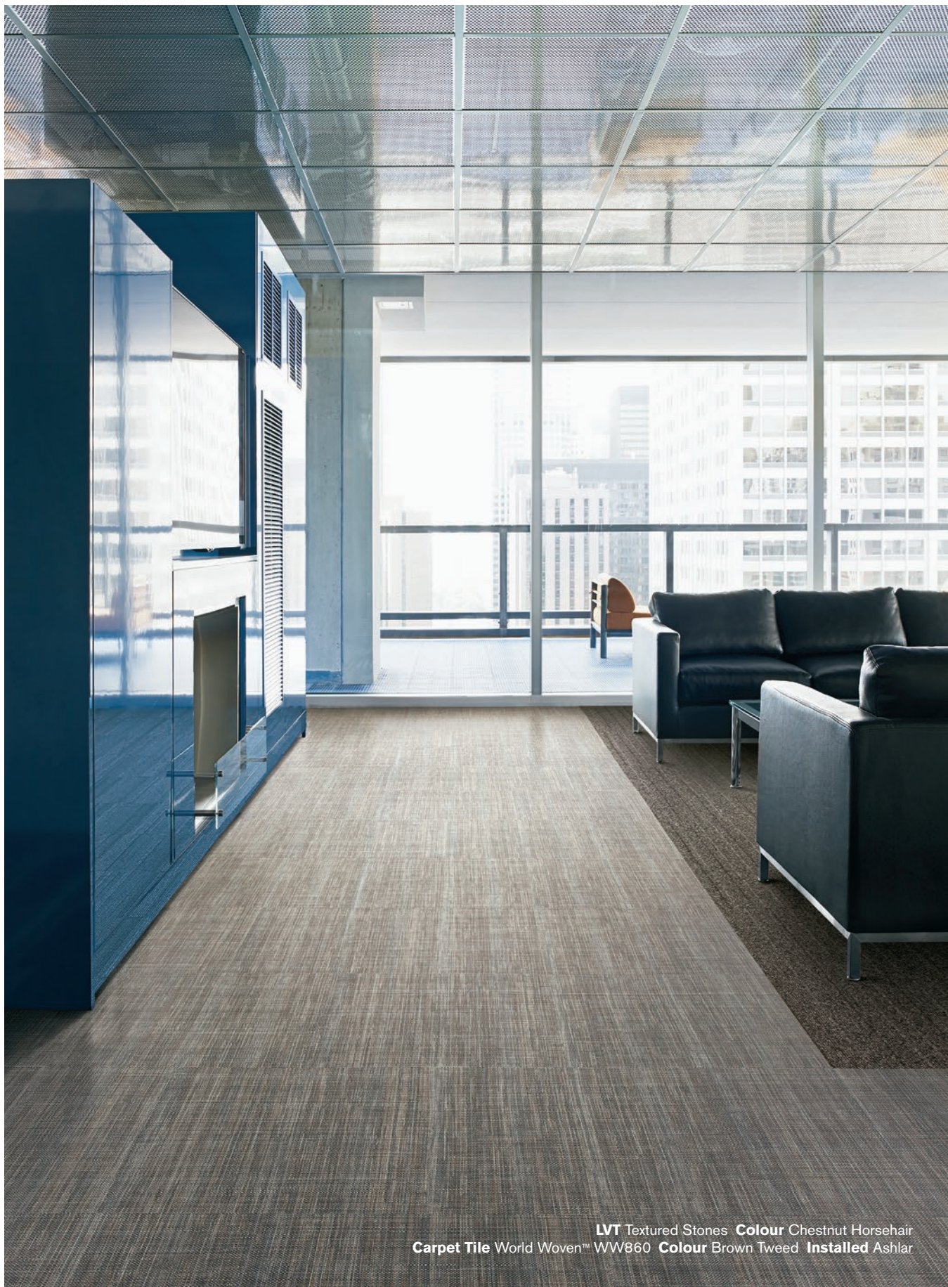
LVT Textured Stones Colour Chestnut Horsehair Carpet Tile World Woven™ WW860 Colour Brown Tweed Installed Ashlar