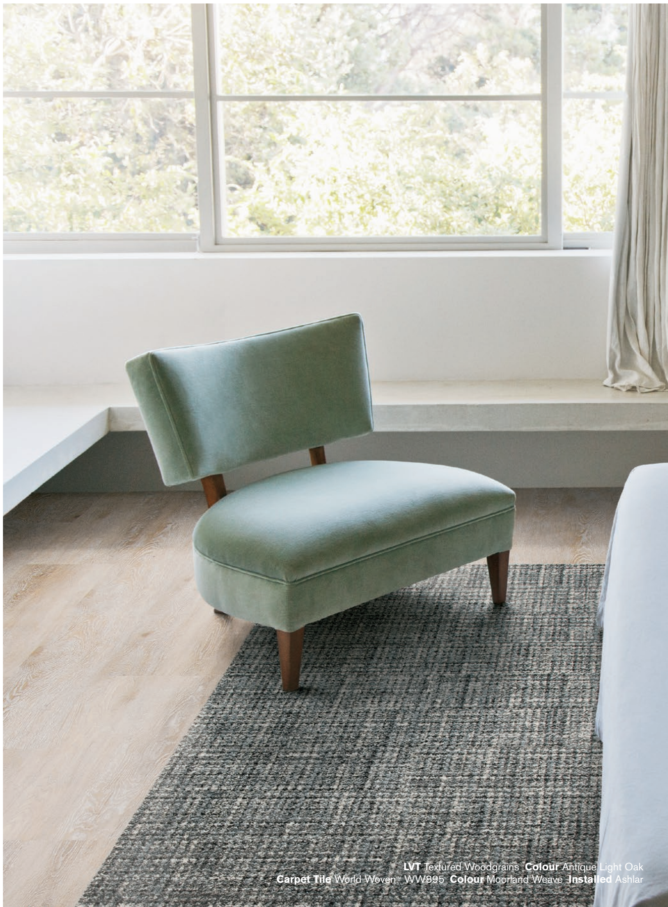
LVT Textured Woodgrains Colour Antique Light Oak Carpet Tile World Woven™ WW895 Colour Moorland Weave Installed Ashlar