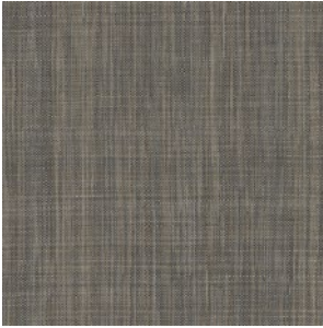
A003-07 Textured Stones - Chestnut Horsehair