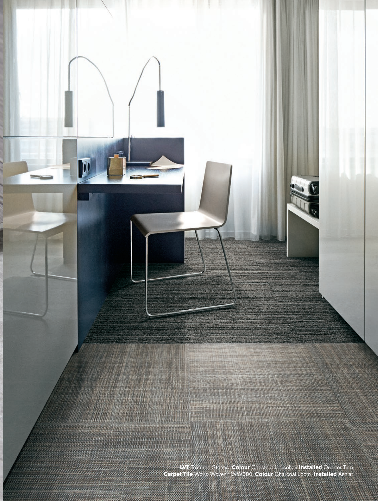
LVT Textured Stones Colour Chestnut Horsehair Installed Quarter Turn Carpet Tile World Woven™ WW880 Colour Charcoal Loom Installed Ashlar