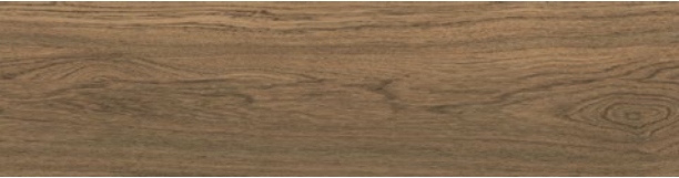
A002-04 Natural Woodgrains - Beech