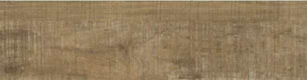
A004-03 NEW Textured Woodgrains - Distressed Hickory