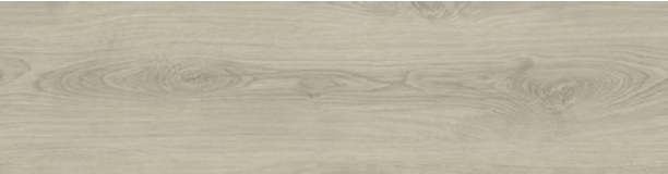
A002-08 Natural Woodgrains - Sand Dune