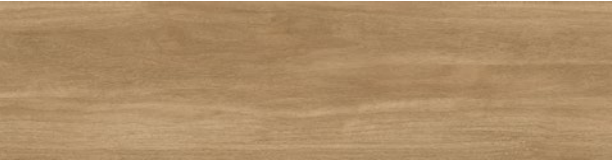
A002-11 Natural Woodgrains - Washed Maple