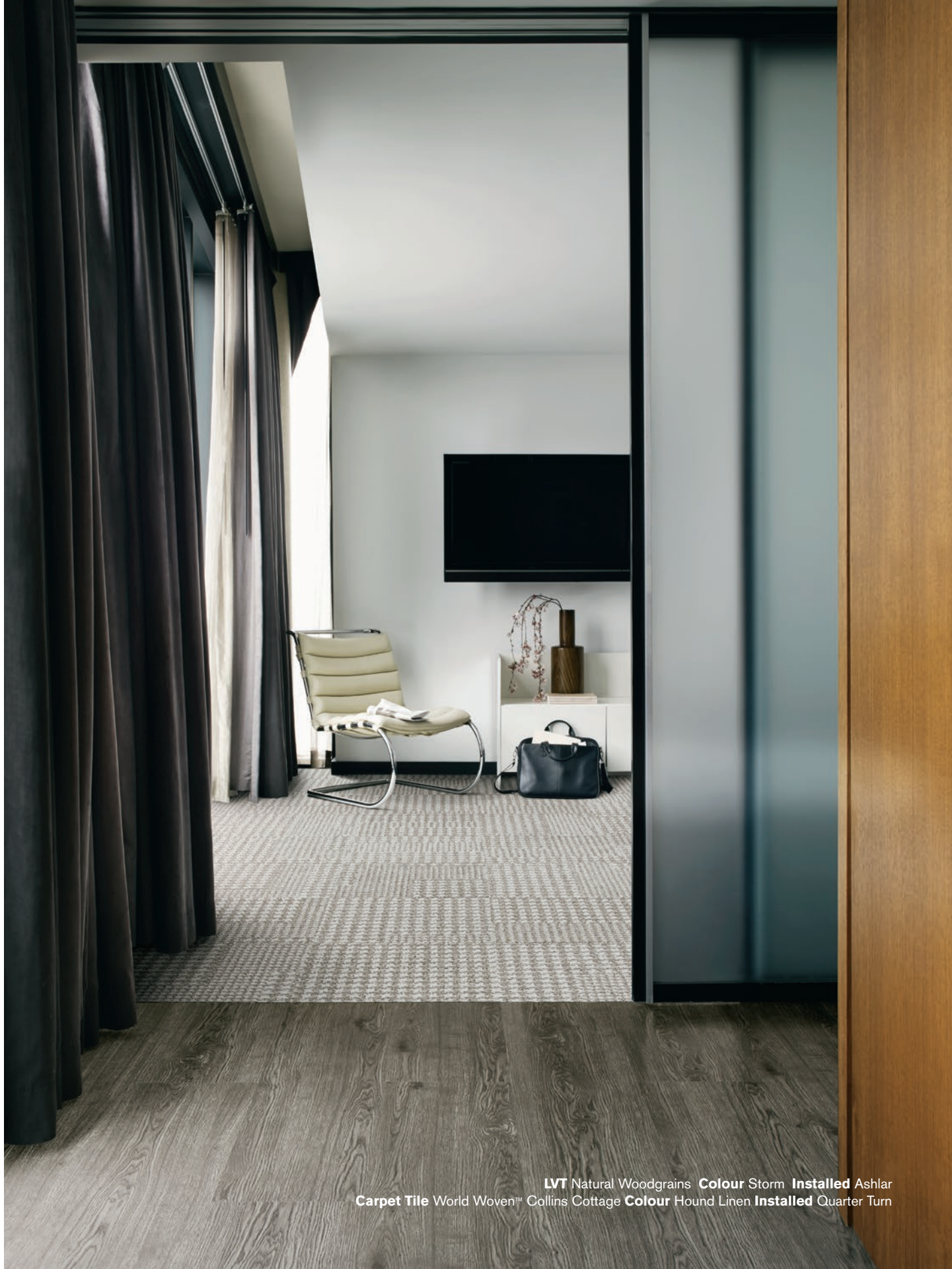
LVT Natural Woodgrains Colour Storm Installed Ashlar Carpet Tile World Woven™ Collins Cottage Colour Hound Linen Installed Quarter Turn