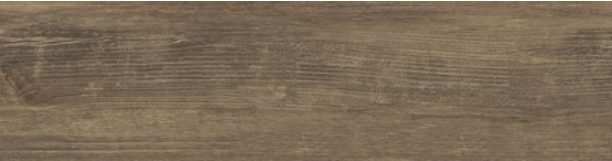
A004-14 NEW Textured Woodgrains - Antique Maple