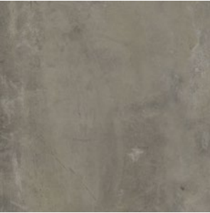
A003-03 Textured Stones - Warm Polished Cement