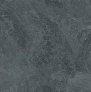
A001-03 Natural Stones - Cool Impala Marble