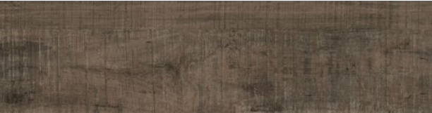
A004-01 Textured Woodgrains - Distressed Walnut