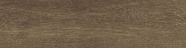
A004-09 Textured Woodgrains - Ash Walnut