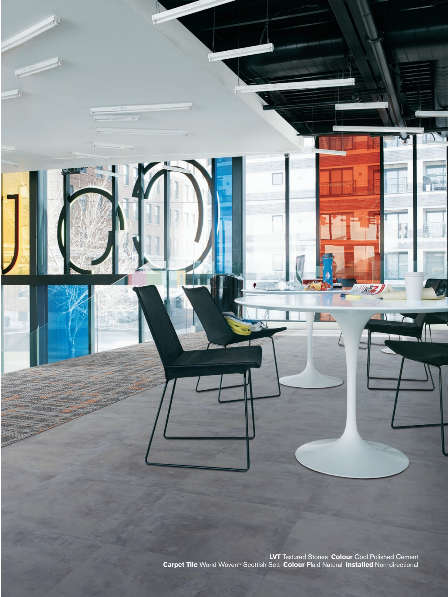
LVT Textured Stones Colour Cool Polished Cement Carpet Tile World Woven™ Scottish Sett Colour Plaid Natural Installed Non-directional