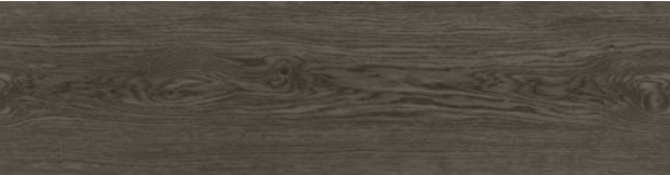
A002-05 Natural Woodgrains - Storm