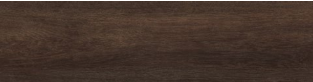
A002-01 NEW Natural Woodgrains - Black Walnut