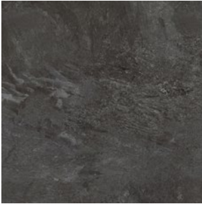
A001-01 NEW Natural Stones - Jet Mist