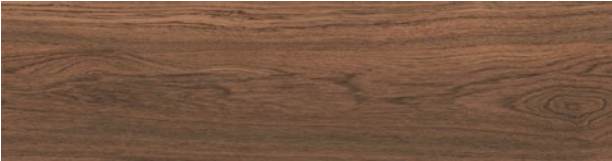
A002-03 NEW Natural Woodgrains - Chestnut