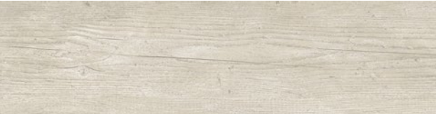
A004-07 Textured Woodgrains - White Wash