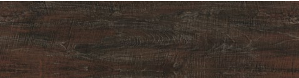
A004-11 Textured Woodgrains - Dark Walnut