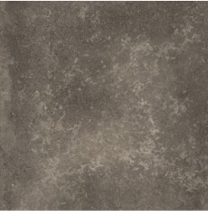
A001-02 Natural Stones - Marone Dark Marble