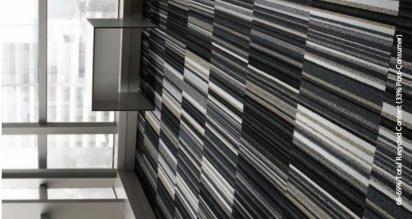
68-69% Total Recycled Content (33% Post-Consumer)

(LEFT PAGE) PRODUCT: BLAST FROM THE PAST™ / COLOR: 6861 GRAY RETRO / INSTALLED: BRICK / PRODUCT: FRESH START™ / COLORS: 9025 MIDNIGHT, 9031 OLIVE, 9032 HERB, 9033 BERYL, 9037 ESPRESSO AND 9048 MANDARIN / INSTALLED: CHECKERBOARD. (RIGHT PAGE) COLLECTION: REDO / PRODUCT: RESSUED™ / COLOR: 8941 GREGE / INSTALLED: BRICK / PRODUCT: SEW RETRO™ / COLORS: 9022 OLIVE/GRABCOO, 9024 COFFEE/MANDARIN AND 9021 SHADOW/PINK / INSTALLED: QUARTER-TURN.