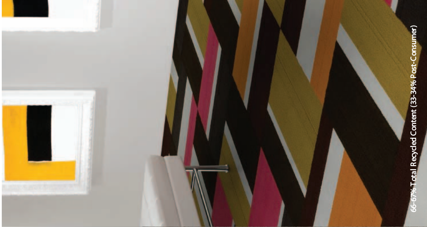
66-67% Total Recycled Content (33-34% Post-Consumer)

InterfaceNZ Ltd - HEAD OFFICE 528 Arrenway Drive, Albany North Harbour 0632. PO Box 305 320 Triton Plaza North Shore City 0757 Phone: 09 441 9850 Fax: 09 441 9851 0800 800 656