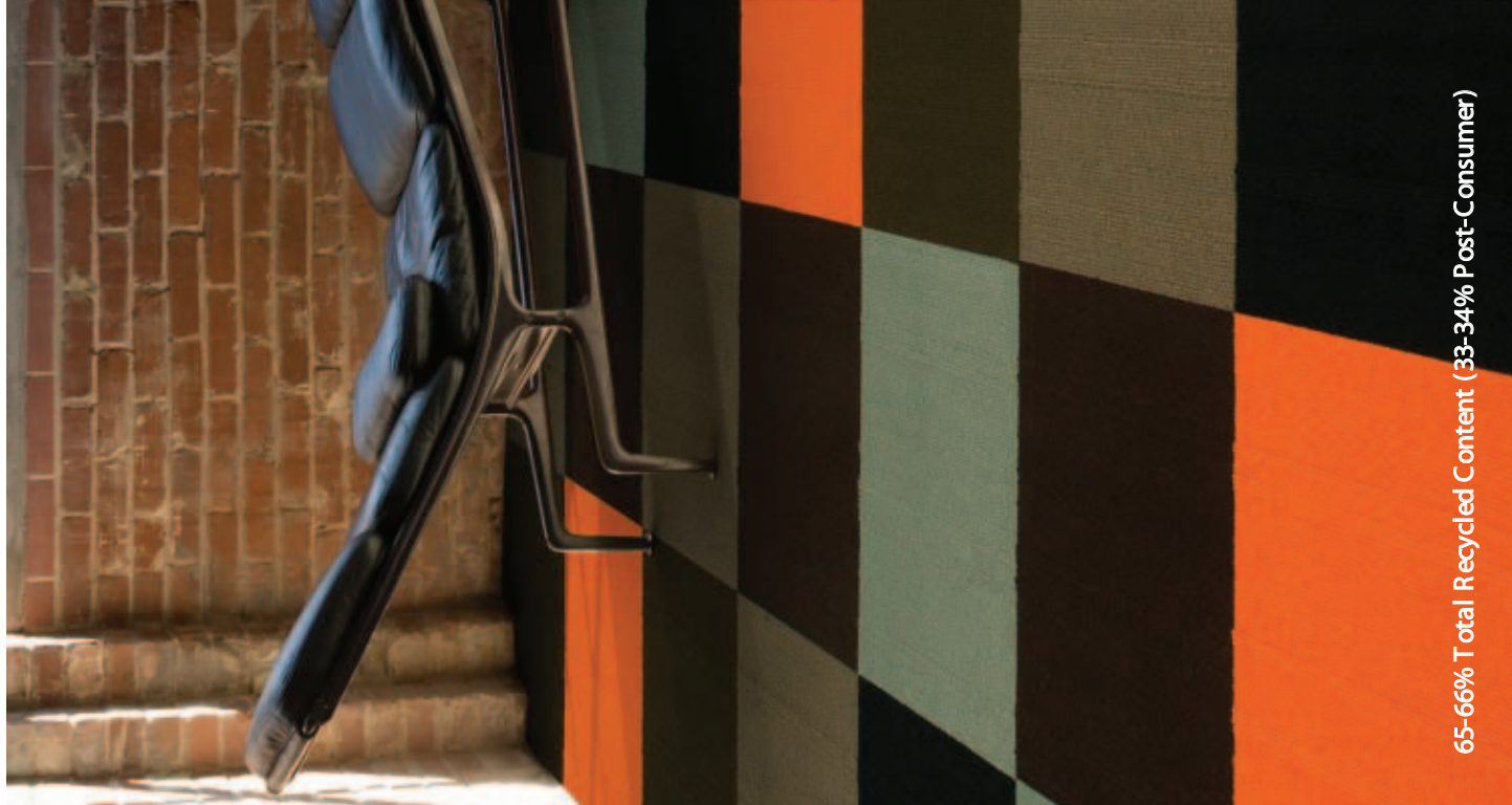
65-66% Total Recycled Content (33-34% Post-Consumer)